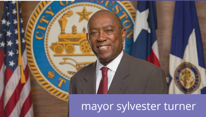
mayor sylvester turner